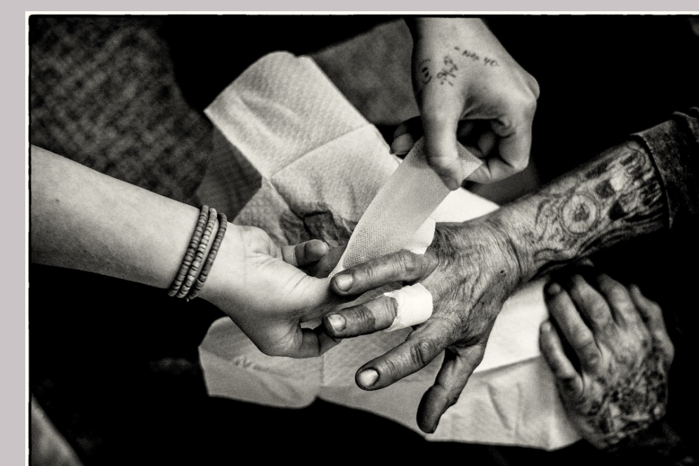
HHC Mobile GP outreach