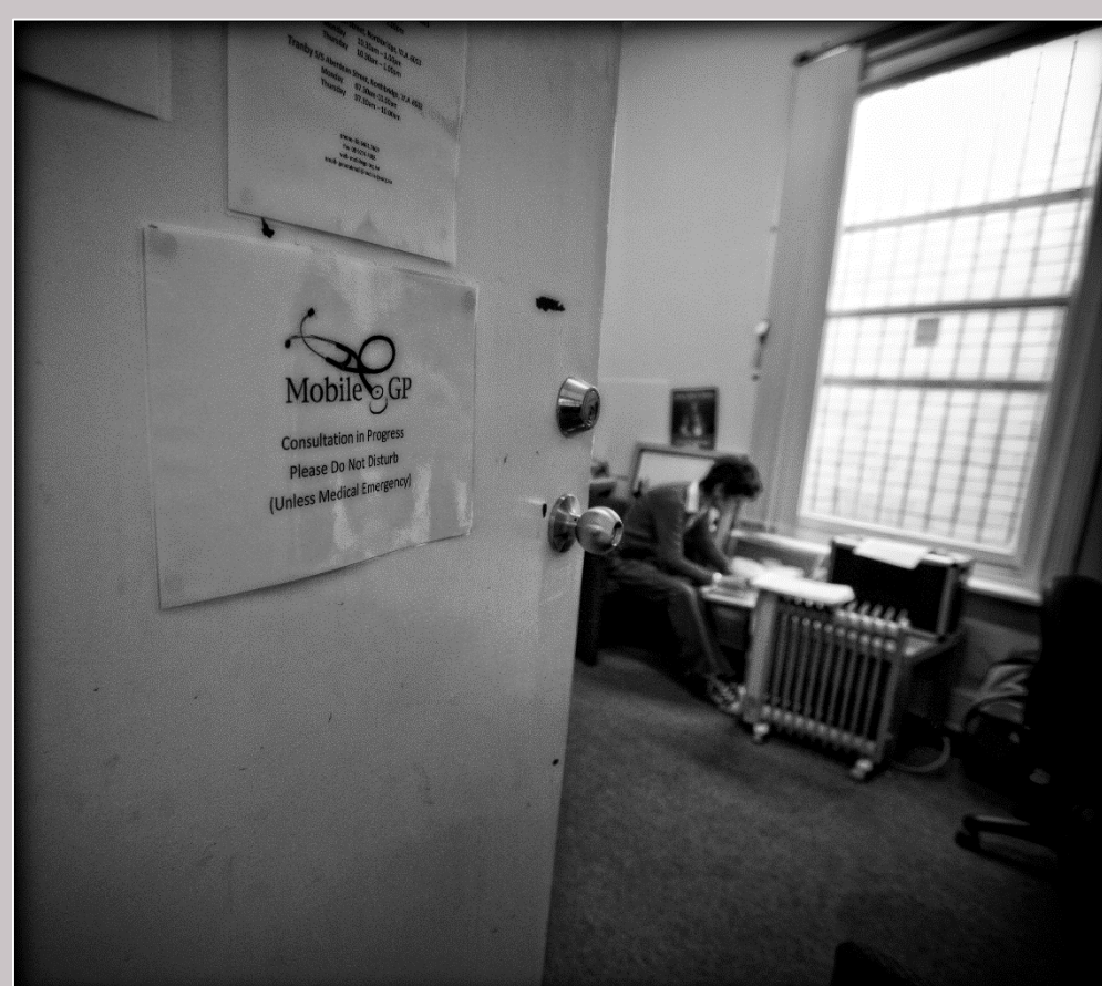
HHC Mobile GP clinic