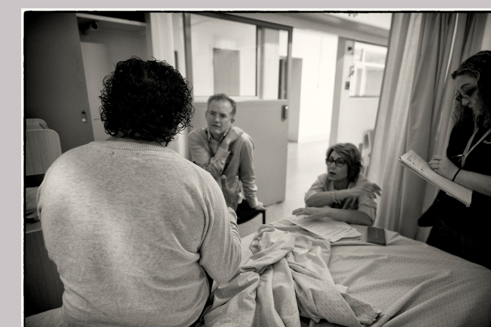
HHC GPs meeting with patient in RPH